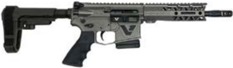
FIXED MAGAZINE CT, MA, NY, NJ, CA, MD, D.C., DE, IL, WA