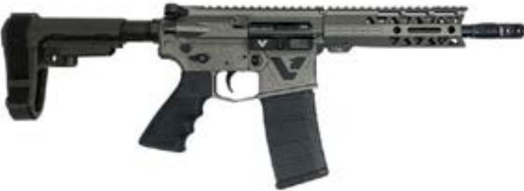
STANDARD MD (States without restrictions)