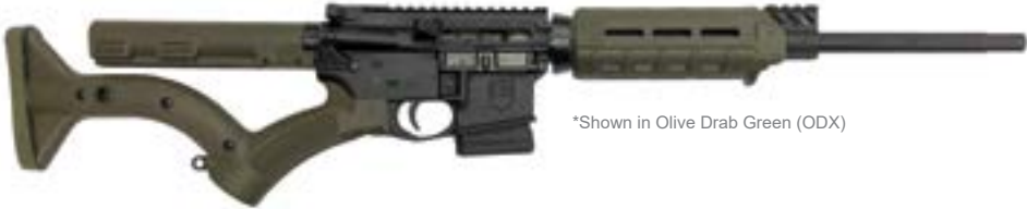
*Shown in Olive Drab Green (ODX)