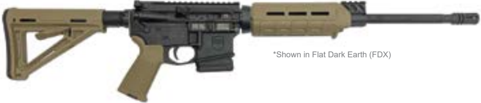
*Shown in Flat Dark Earth (FDX)