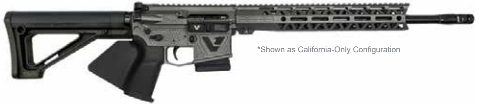
*Shown as California-Only Configuration

NY, CA, DE, D.C. (States without restrictions)